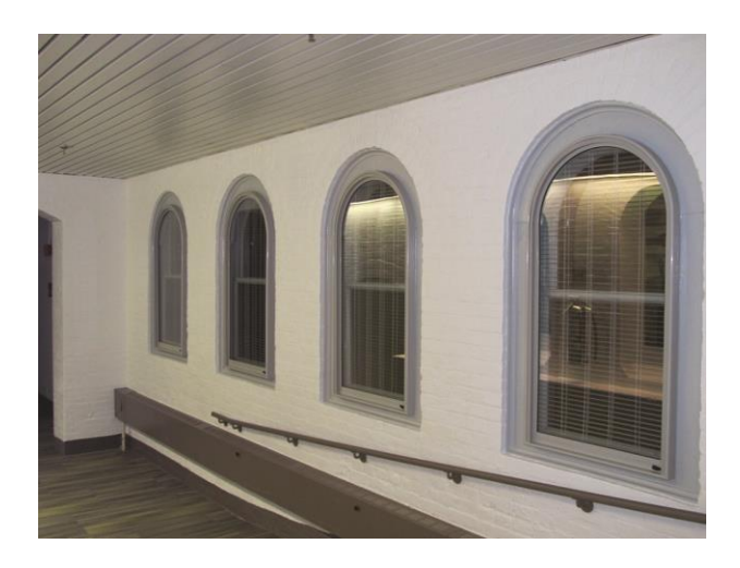
Thermolite Window Systems installed in the hallway, viewed from the inside.